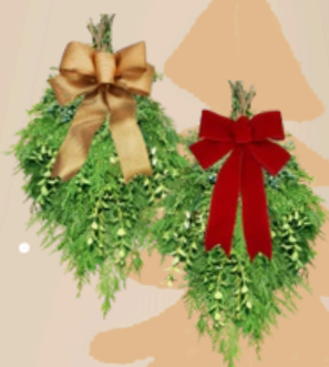
Fresh Door Swag