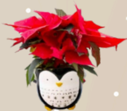
Peppermint the Penguin

Thank you for supporting local community groups!