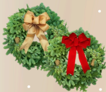
Fresh Evergreen Wreath