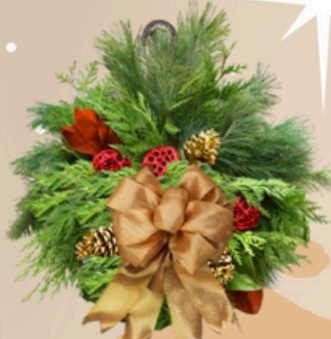
Fresh Evergreen Basket