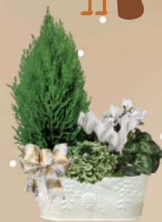
8" Cyclamen White Tin