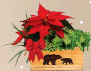
8" Beary Merry Planter