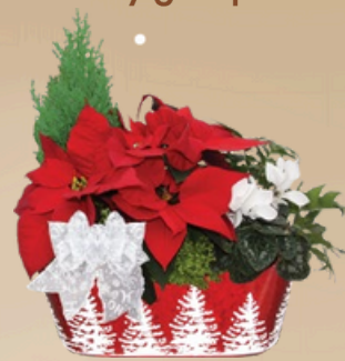
12" Poinsettia Red Tin