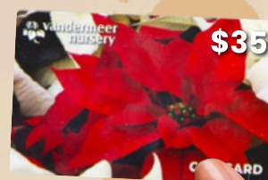
Vandermeer Gift Card